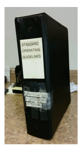
Figure 1: The SOP binder in the fire department where we conducted this study.

DOI: http://dx.doi.org/10.1145/2957792.2957794