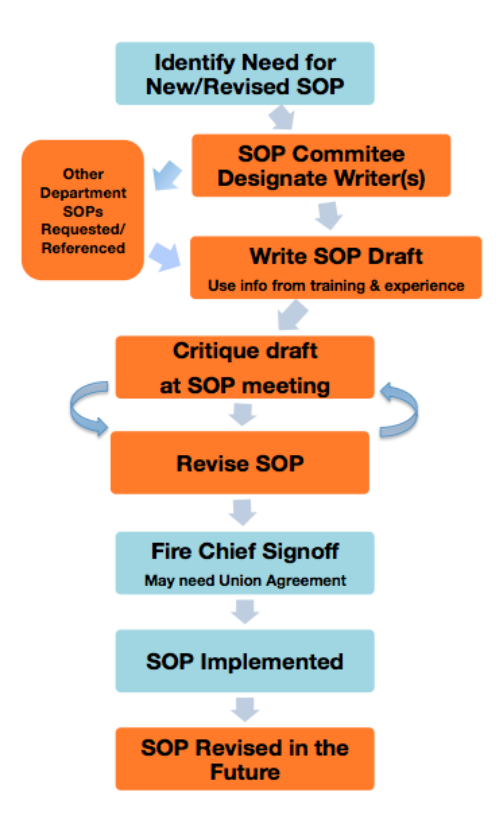
Figure 2: Diagram of a typical fire department SOP creation process. The FPRF designed FireCrowd to intervene in the steps represented in orange boxes.

Open collaboration and social computing systems offer unique advantages for facilitating knowledge sharing, transactive memory, coordination, and information diffusion across a number of domains [2, 6, 12]. However, introducing open collaboration into the safety protocol management of a command and control organization such as the fire service presents specific design challenges. On the one hand, systematic SOP review is necessary to ensure high quality, reliable protocols. On the other, protocols should be updated quickly and take advantage of the knowledge spread across individuals in many departments. These competing demands create tensions between hierarchy and openness that existing research has not explored.